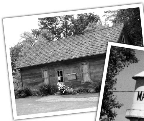
◀ The Gehl Pioneer Homestead, built in 1884, was renovated by the Historical Society and is located at Jennings Park.

In 1986, The Society purchased a plot of land off Armar Road as the future site of this museum. An architect has created the museum on paper and now we are ready to move forward to the final phase ~ construction. The Marysville Historical Society is a non-profit organization and the building of this museum will be in the hands of our community. Marysville has a colorful history. Through this museum, we will keep that knowledge alive for future generations.